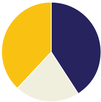
ASSETS BY FUND TYPE