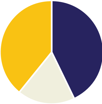
ASSETS BY FUND TYPE